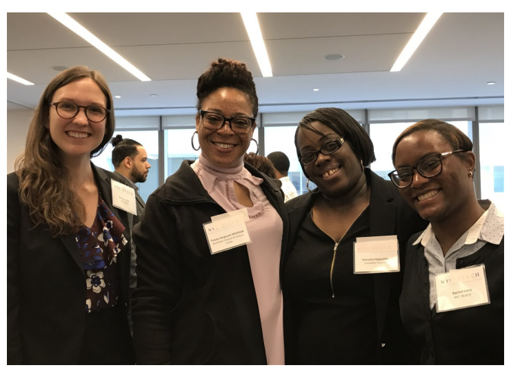
NYC REACH experts network with attendees

Read about the other portions of this event on page 4.