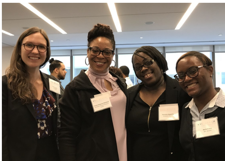
NYC REACH experts network with attendees

Read about the other portions of this event on page 4.