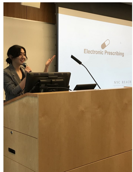
NYC REACH expert addresses questions about e-prescribing

One key change discussed was the new health information technology requirements. EPs will need to use a 2015 edition of certified electronic health record technology (CEHRT) to submit data for Stage 3. Using a 2015 CEHRT is required because some of the Stage 3 objectives cannot be met with previous editions.